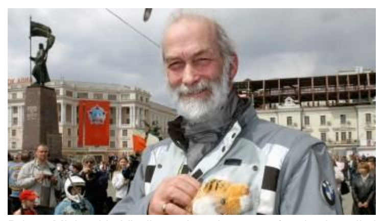
Prince Michael in Vladivostok at the start of a charity rally in 2005

https://www.thetimes.co.uk/article/prince-michael-of-kent-investigation-calls-for-inquiry-into-shocking-result-of-insight-probe-j3k9njkld